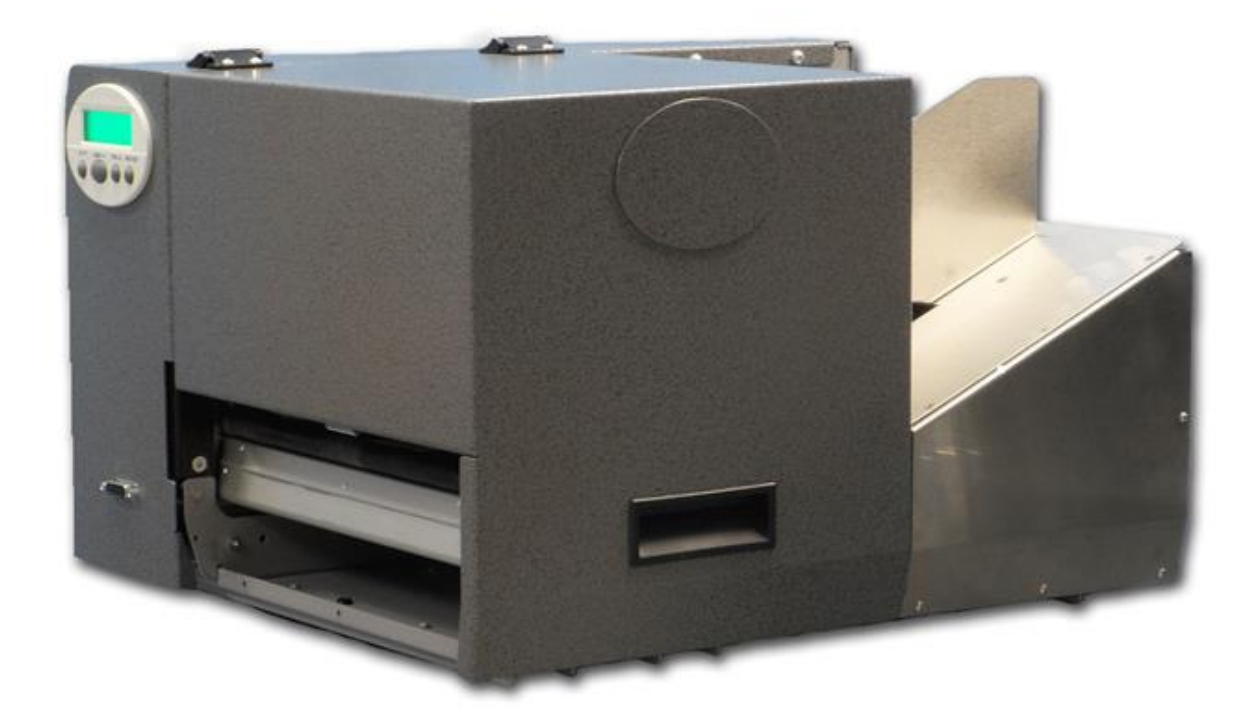
Fig 2: DoraniX ThermaPrint 64 Direct-to-Product printing system

Ultimately in the near future medical device manufacturers will be required to ensure that all devices are adequately labelled and identifiable within the constraints of the newly applied FDA UDI guidelines. Any procurement decisions relating to labelling needs must be supported by proven and technologically sound printing solutions, incorporating the specificity of the class of device and current stage of identification in order to achieve regulatory approval. At <u>DoraniX</u>, we believe that we are an excellent choice of partner for all VDP requirements offering an unrivalled level of service combined substantiated by outstanding experience within the medical packaging sector. Our team are able to offer support and technical expertise alongside educated advice and personal contact. We truly believe that we are the leading provider in innovative product identification and bar coding products, and we do have the capability to take the stress out of the UDI labelling headache for medical devices.