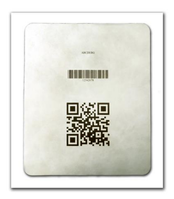
Fig 4: DoraniX VDP print example incorporating bar coding and QR code

Fig 3: DoraniX VDP print example onto Tyvek® pouch