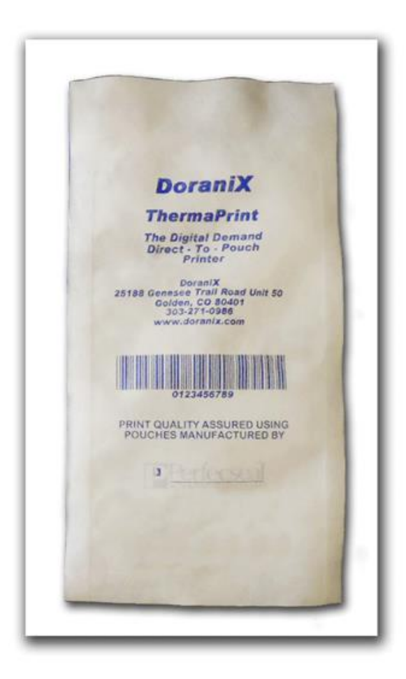
Fig 3: DoraniX VDP print example onto Tyvek® pouch