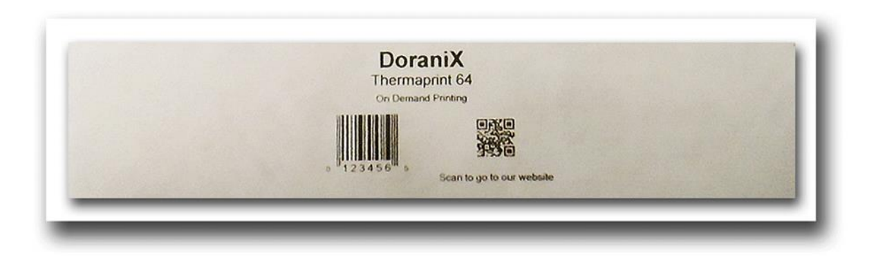
Fig 5: DoraniX VPD print example illustrating differential labelling to accommodate packaging shape

Please contact our office to have a personal consultation and request a quotation: